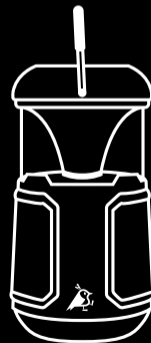
Modell: Soundbird B10