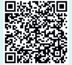
Humly Room Display

Humly Room Display is the perfect interactive display for your collaboration spaces. It will help you to find the space you already booked, or guide you to one that is available right now.