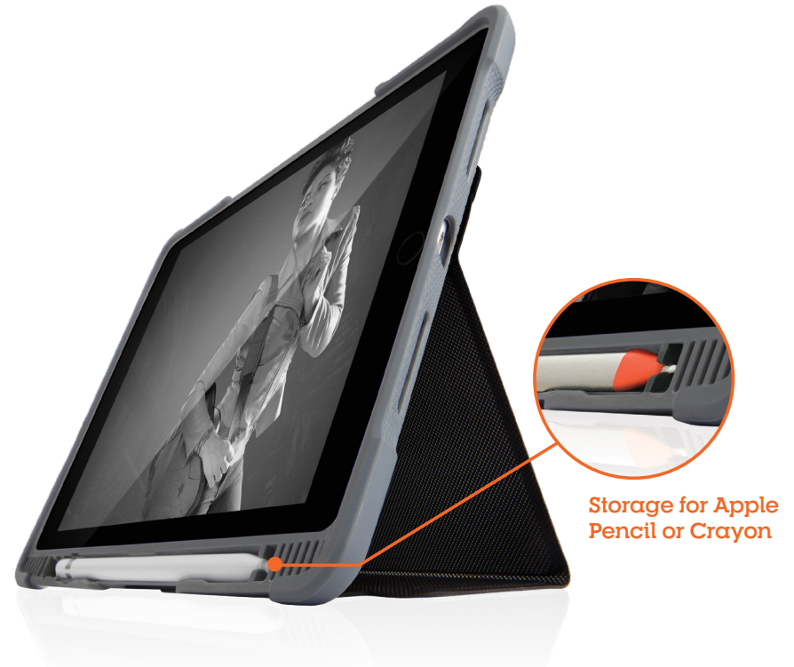
Storage for Apple Pencil or Crayon

the smarter case - for iPad 5th & 6th gen