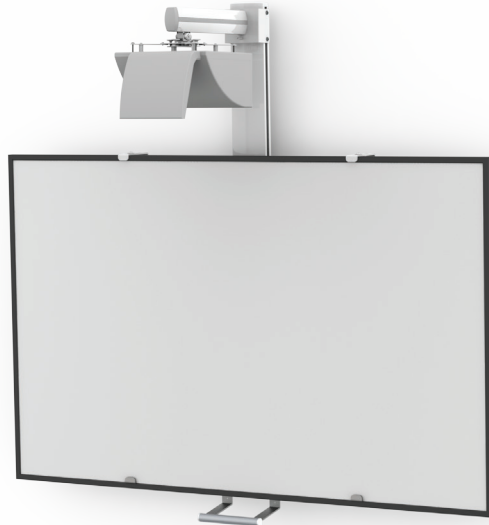
Board and projector are not included.