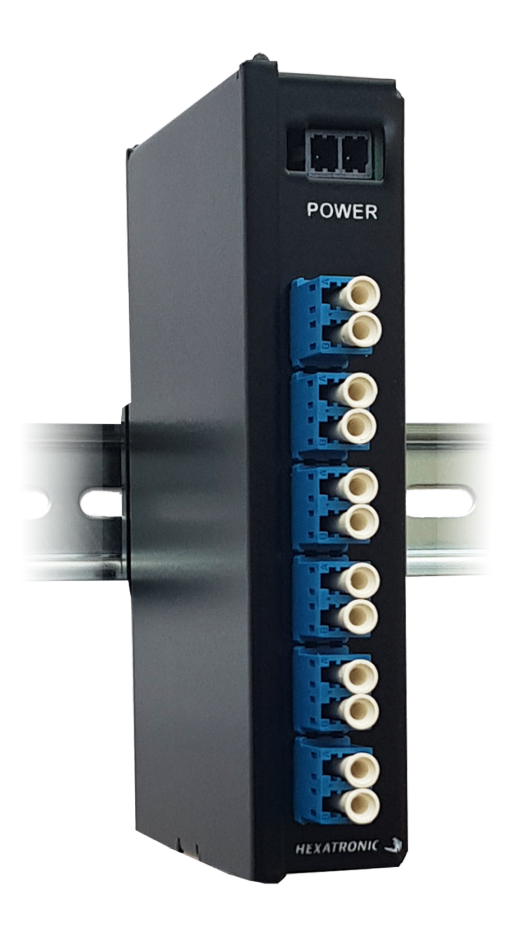
Hybrid ODF mounted on DIN-rail