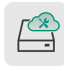
Cloud device management

Supports temperature, humidity, and illumination in meeting rooms, enabling data reporting and integration strategies.