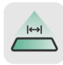
Customizable detection area

Covers larger areas, reducing the number of deployed sensors and lowering enterprise costs.