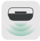
Wide detection range

Covers larger areas, reducing the number of deployed sensors and lowering enterprise costs.